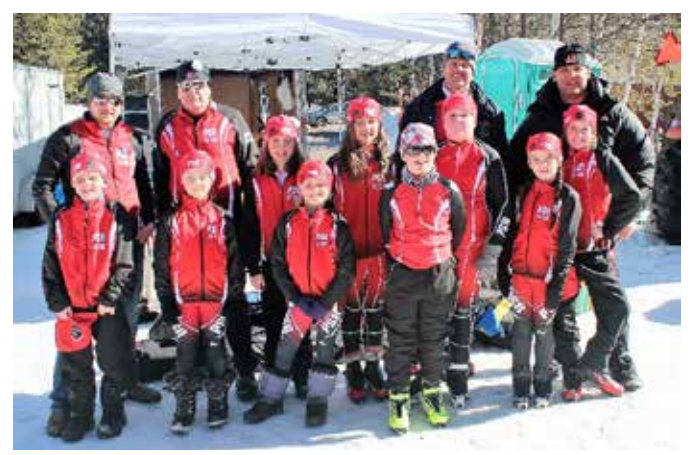
The PSR JD Ski Team and coaches at the Ontario Cup #4

however, many of these young athletes demonstrated their dedication to the sport by training an additional 2-4 times each week on their own. As a result, they were able to reach impressive distance goals, including some racers skiing upwards of 450km in the season!